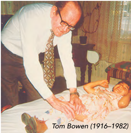
Tom Bowen (1916-1982)

Tom found the time he spent helping children with disabilities extremely rewarding and the Tom Bowen Legacy Trust Fund was set up to continue this important work.